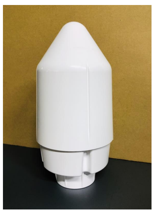
External View unit(mm)

This device has a patch antenna with a ground plane, and because it is a structure that is less susceptible to multipath, it is characterized by a relatively flexible degree of freedom in the selection of installation sites.