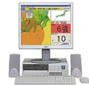
An Image of QCAST® Alert System

The aerospace observation instrument developed by Meisei Electric is of full use for space astronomical science.