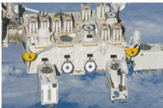
“MAXI” Installed on the Overboard Experimental Platform of the “KIBO”

The Monitor of All Sky X-Ray Image (“MAXI”), which is on Japanese Experiment Module (“KIBO”) in coordination with the gamma-ray burst satellite Swift (USA), has observed the instant of a massive black hole swallowed a star for the first time in the world, located in the center of a galaxy 3.9 billion light year away. The “MAXI” is called as “Space Astronomical Observatory”, for which we were very deeply involved in both development and manufacturing. In July 2009 it was installed on the overboard experimental platform of the “KIBO” and since August 2009 it has continued to monitor the whole sky x-ray. The result was disclosed on the newspapers issued on the 25 th August, 2011. For the details please see: http://www.isas.jaxa.jp/e/forefront/2011/kawai/index.shtml