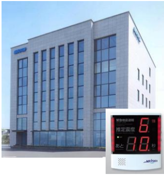
S740 Alert Unit at Mutual Aid Organization in Miyazaki Prefecture